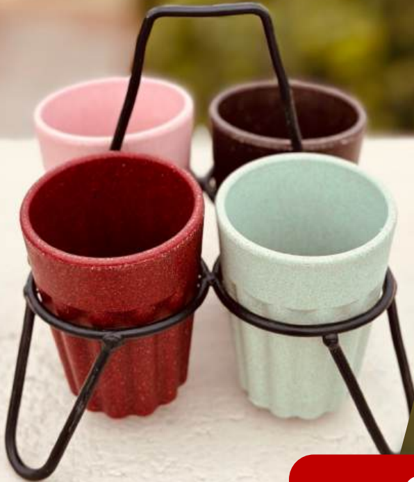
Coffee/Rice Husk - Small Coffee Cups