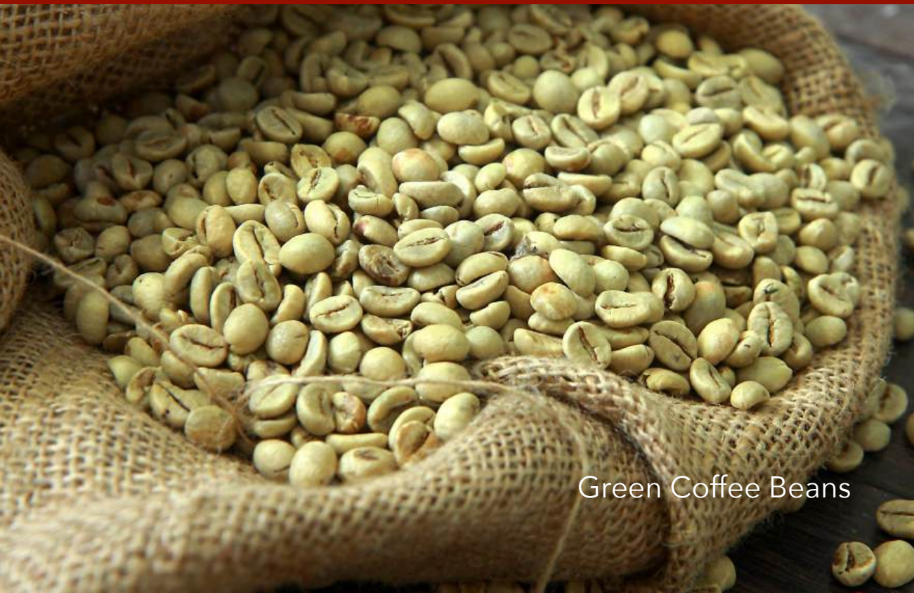
Green Coffee Beans