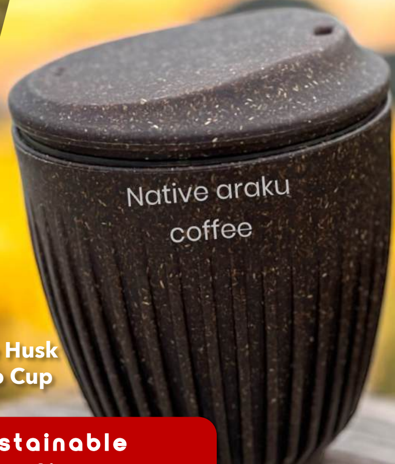
Coffee Husk - Retro Cup