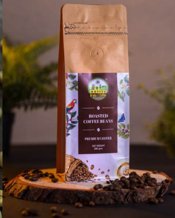
Roasted Coffee Beans