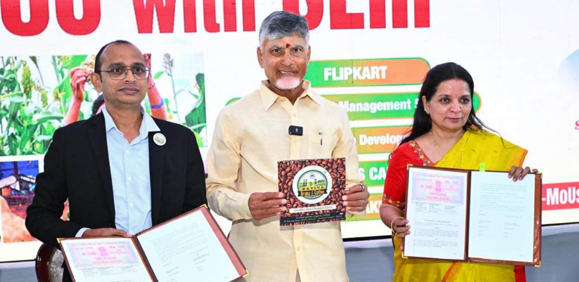
An MOU to Establish Women-Driven 100 Coffee Shops in AP