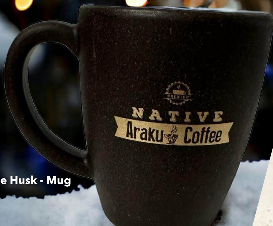
Coffee Husk - Mug